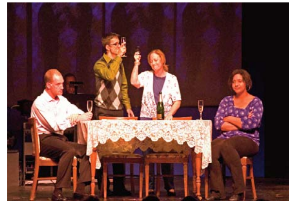
Meet the Parents from I LOVE YOU, YOU'RE PERFECT, NOW CHANGE Sept. 2010

Not every play in print is able to be produced by MHT. Some are still touring professionally which means MHT can not get rights of production. Some plays require a set larger in size than our current theatre can accommodate. Due to content, some plays will not play well in Paducah. (Yes, the intended audience has to always be kept in mind.) Plays with little name recognition are harder to "sell" than those plays people tend to know. Some plays work better in a smaller format than on the main stage. The readers have to keep in mind a balanced season which allows for casting a wide range of ages and talents. A balanced season also includes a mix of various genres of theatrical presentations. The play readers even need to remember the budget when making suggestions. Will a chosen play provide funds to help offset production costs? (Production cost is another whole topic for a later date.) Traditionally a large musical has ended each season in June.